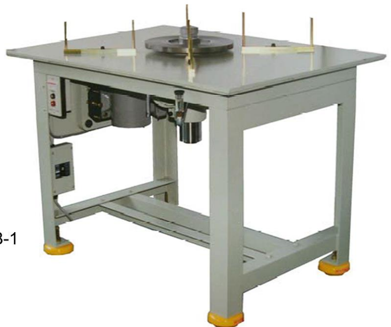
A welded structure frame of DPB-1