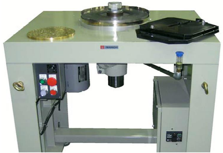
A modification specification of DPB-3

The machine body is tough welded structure and has a cost-beneficial performance.