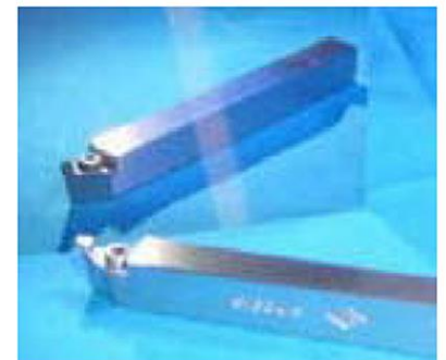
Processed diamond tool

90^{\circ} \pm 0.05^{\circ} at 500 times power