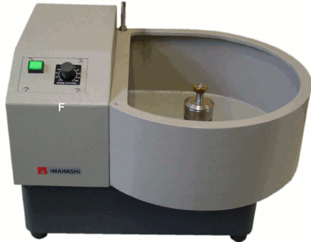
FAC-8IRS standard model